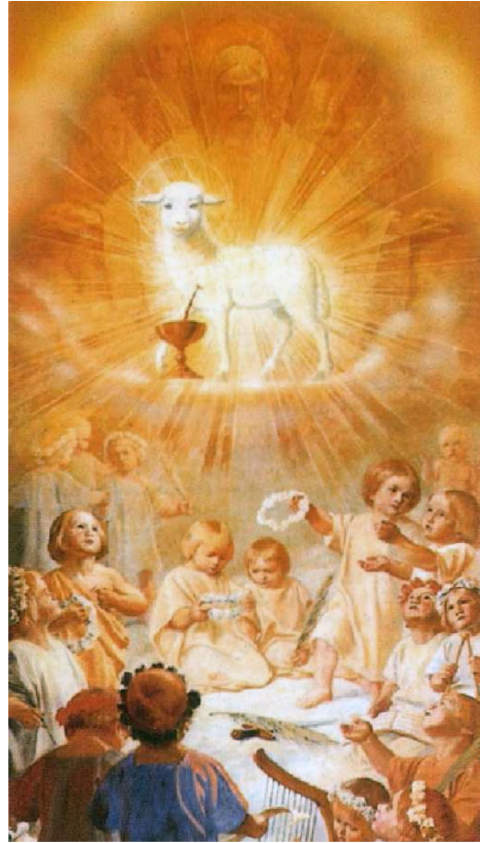
ATONEMENT MASS for the Guilt of Abortion

Brüder Samariter FLUHM Kloster Hafnerberg 13 A-2571 Altenmarkt/Triesting